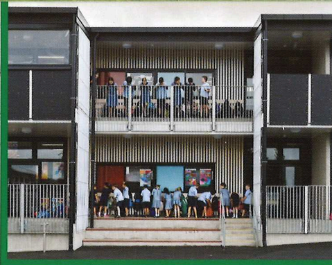
Marist School, Mt Albert