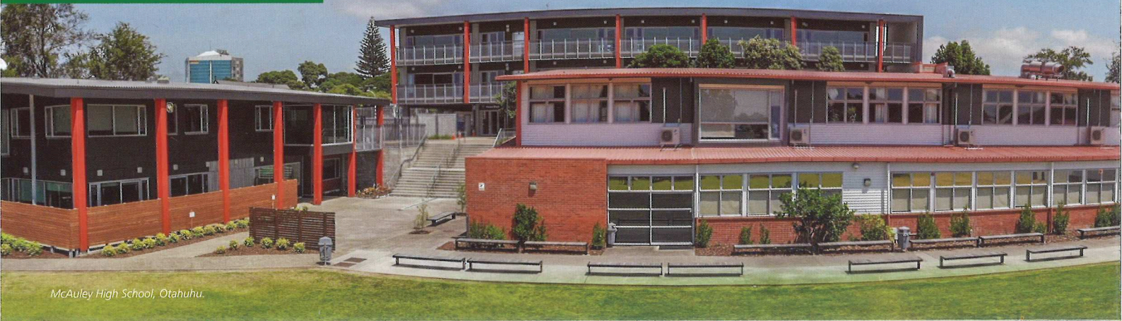
McAuley High School, Otahuhu.

Providing for Catholic Schools in the Auckland Diocese