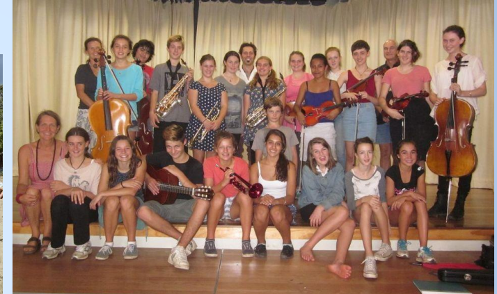
Combined club music ensemble