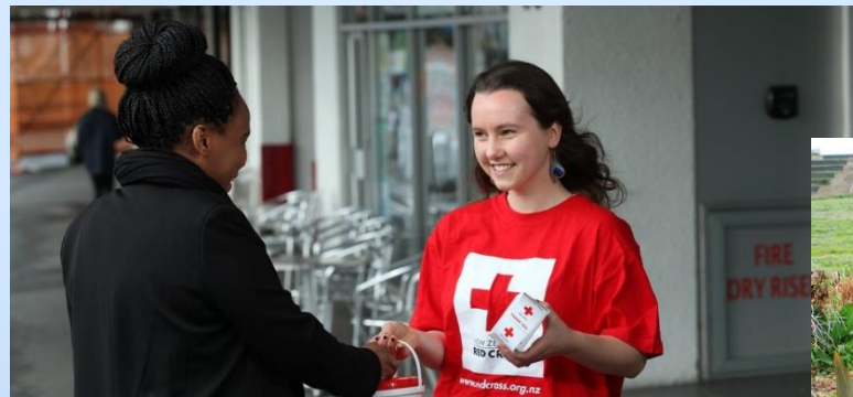
Red Cross Collecting