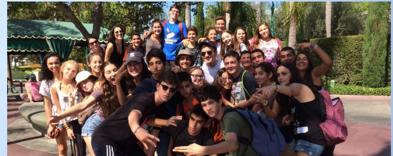
Trip to local beach