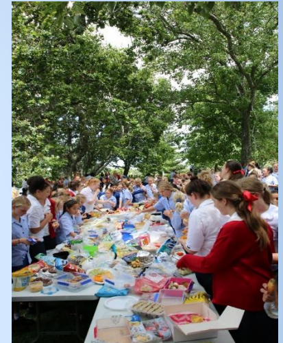
School Event organising