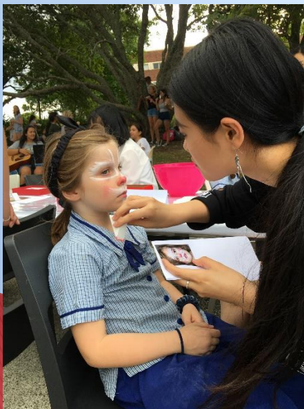
Face painting stall at Fair to raise money for charity