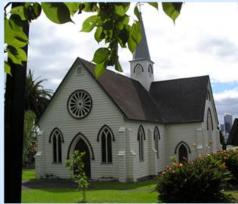
The St Mary's Chapel in the school grounds